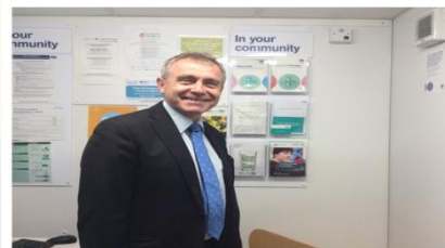
Robert Goodwill MP Boots Pharmacy, Whitby